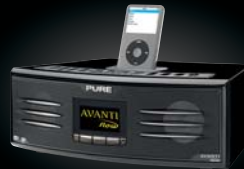
AVANTI Flow with iPod

* requires registration on www.thelounge.com