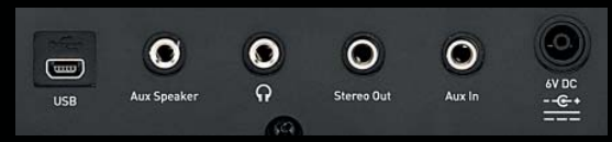
EVOKE Flow connectors