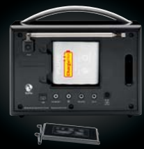
Installed in seconds, ChargePAK E1 gives up to 15 hours listening

* requires registration on www.thelounge.com